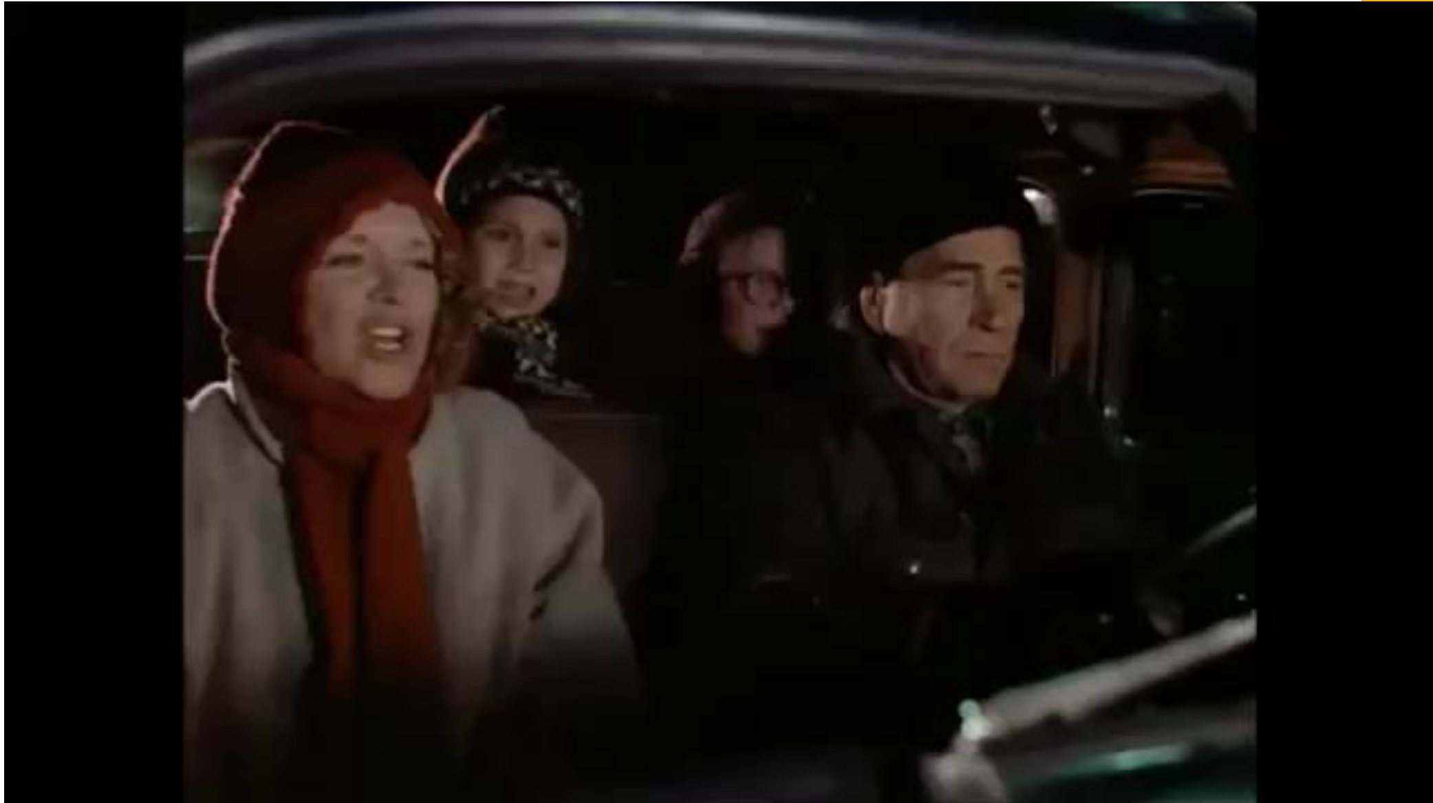
A Christmas Story (1983)